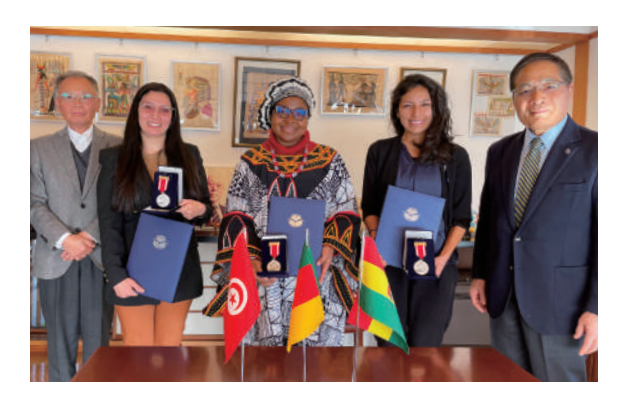
At the graduation ceremony, the chairperson encourages the fellows to continue their research activities in their home countries. Even after they leave Japan, the MIF will always cherish them for years to come.