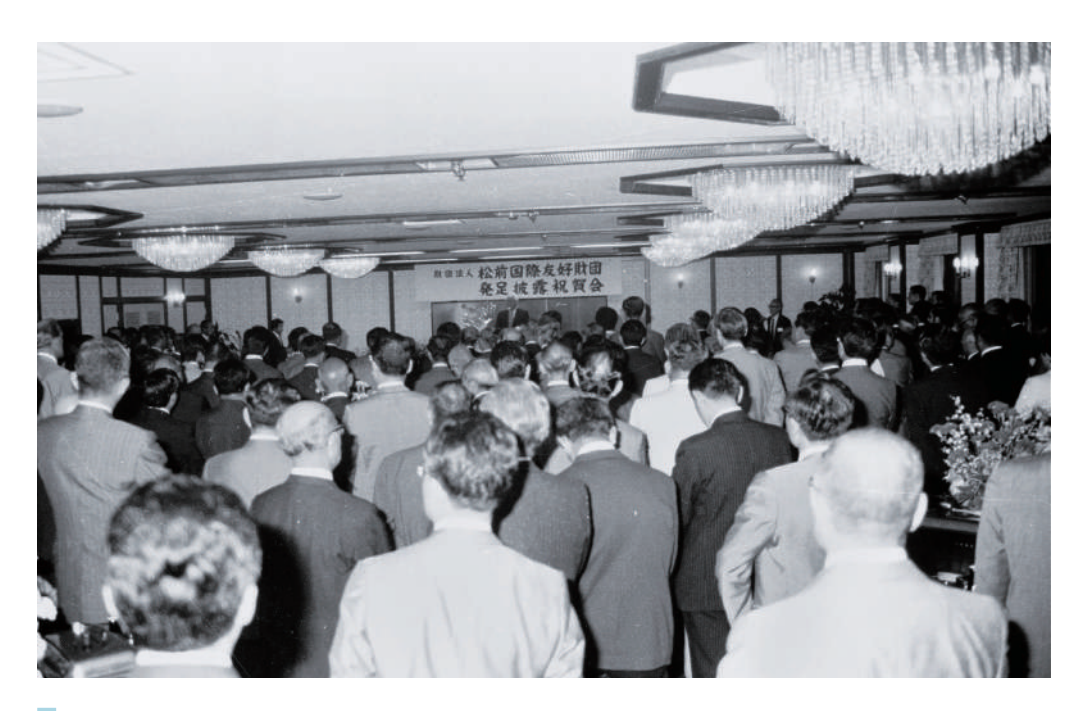
The Matsumae International Foundation was established in June 1979 with the support and cooperation of many Japanese individuals and organizations. The inauguration ceremony was held next month with representatives from the embassies of many countries and guests from numerous organizations in Japan.

Principle and Activities of The Matsumae International Foundation Principle and Activities of The Matsumae International Foundation