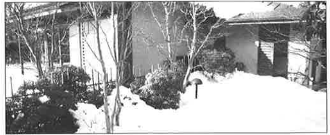
MIF office in the snow, February 2014

Received in the period from December 2013 through February 2014.