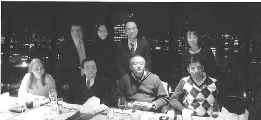
Tokyo Night tour