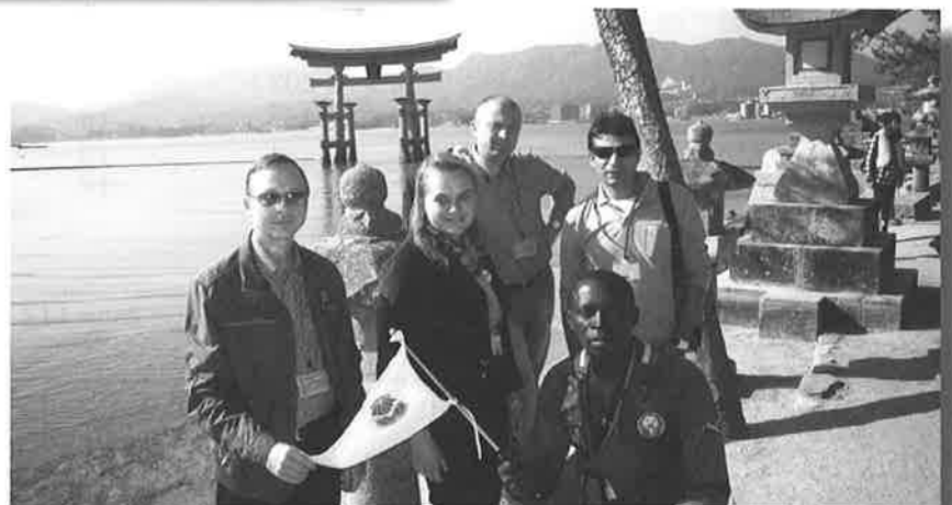
At Itsukushima Shrine, Miyajima, Hiroshima