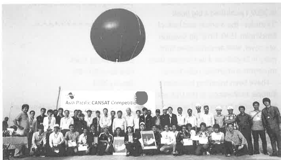
CANSAT Competition at the APRSAF-20 Conference in Hanoi