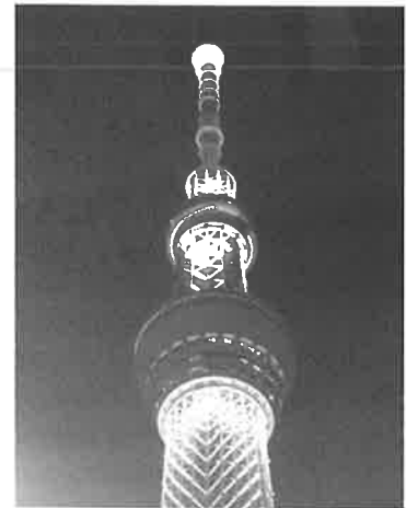
Tokyo Sky Tree