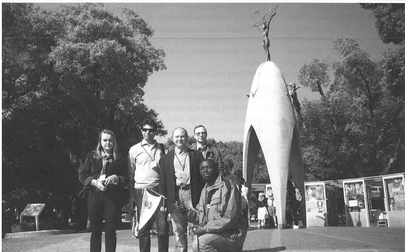
Study Tour At Hiroshima Peace Park October 2013