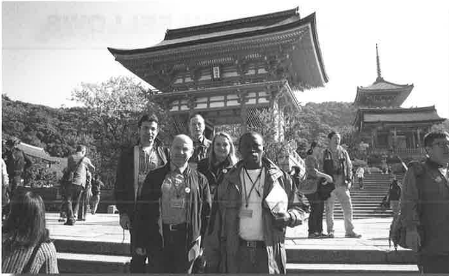
At Kiyomizu Temple, Kyoto