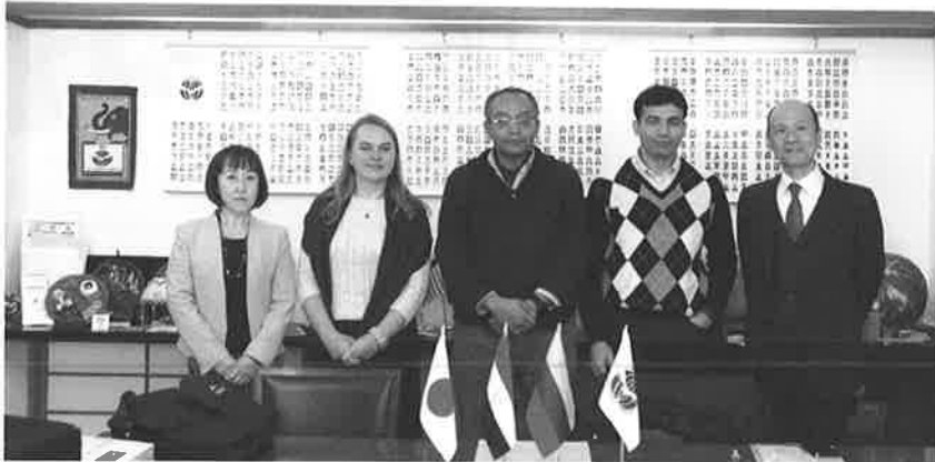
Presentation by MIF Research Fellows at MIF Reception Room